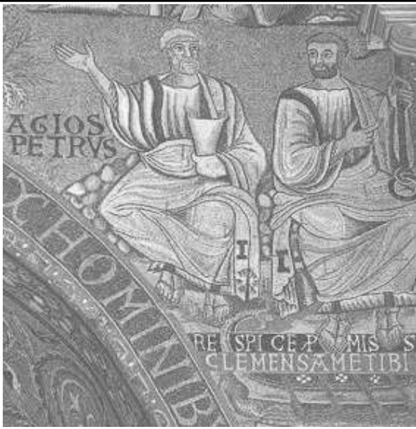
Saints Peter and Clement, detail of the twelfth century mosaic in the apse of the San Clemente Basilica, ia Labicans, Roma 95